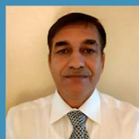
Editor in Chief