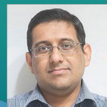
Vice President (Jr.)