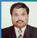
Vice President (Sr.)