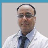
Editor in Chief